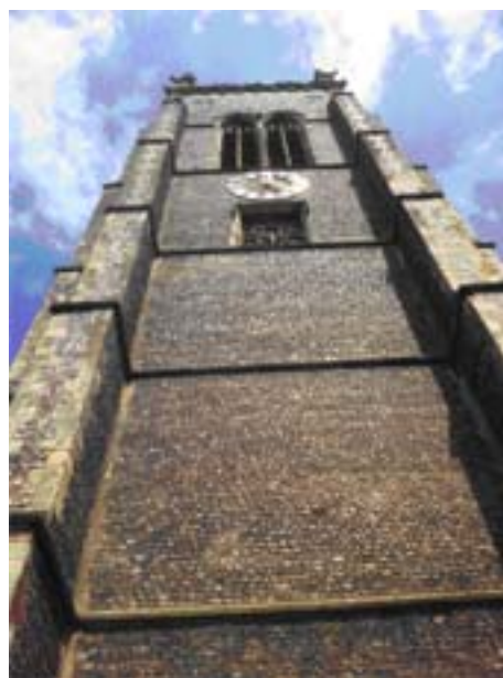
and a very high tower!