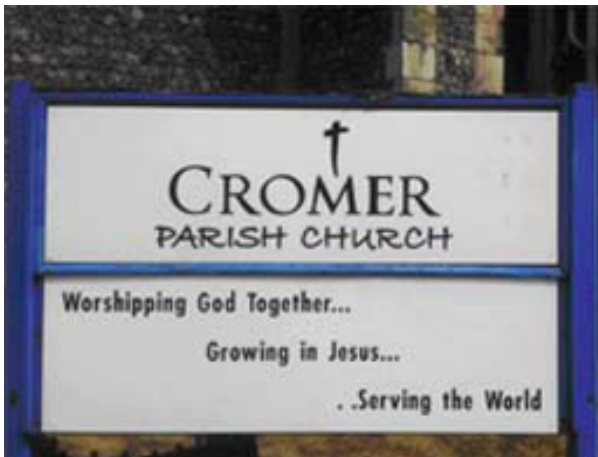
A welcoming sign