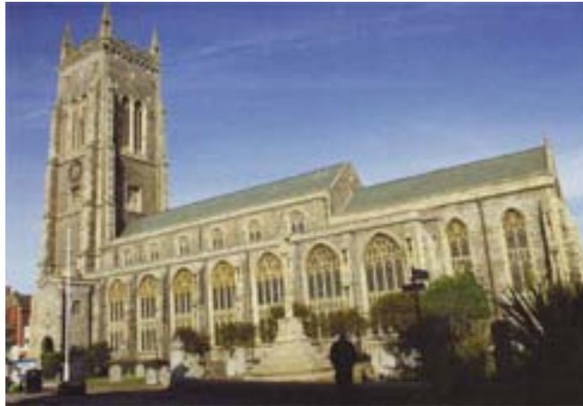
A very large Church!