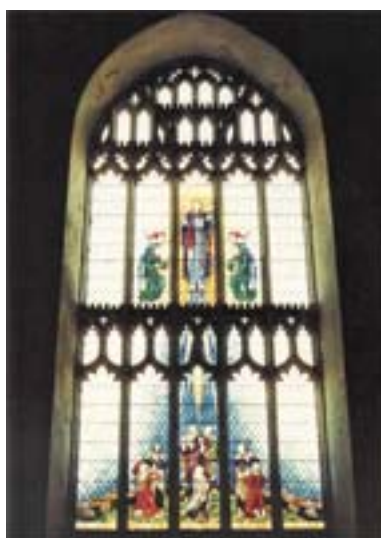
The Ascension window