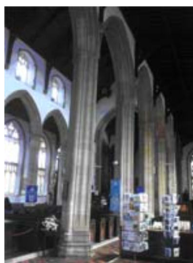
The lofty interior

Pictures from Jon Lyus and from a Postcard of the exterior